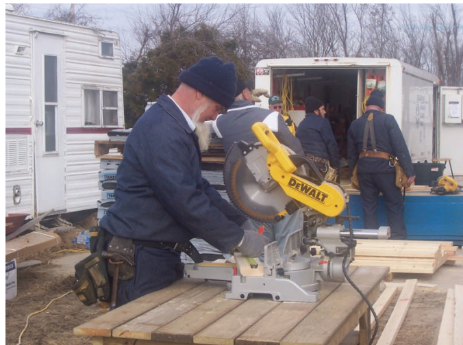
Transforming a Trailer: Many hands make light work.

Dulzura is southeast of San Diego where fires had destroyed homes last year. This MDS project will be building new homes, and cleaning away brush that may be a fire hazard to these new homes. In order to get permits for building, all brush must be cleared at least 100 feet around the new home.