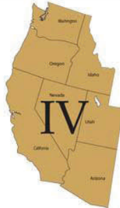
MDS REGION IV